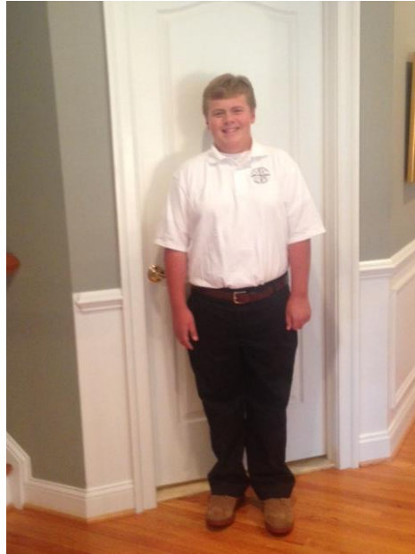
Photo 5 White polo & blue pants FALL/SPRING