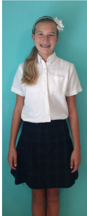
Photo 12 White oxford & plaid skirt WINTER