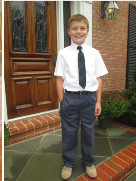
Photo 6 White oxford, blue pants, tie WINTER