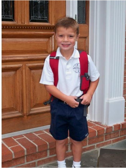
Photo 1 White polo & blue shorts FALL/SPRING