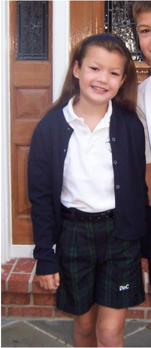
Photo 9 White polo & plaid shorts FALL/SPRING (shown with optional blue buttoned down sweater)