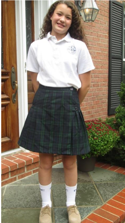
Photo 11 White polo & plaid skirt FALL/SPRING