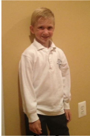
Photo 2 Long sleeved polo & blue pants WINTER