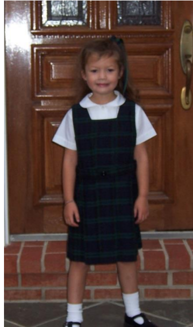
Photo 10 Plaid jumper & blouse FALL/SPRING/WINTER