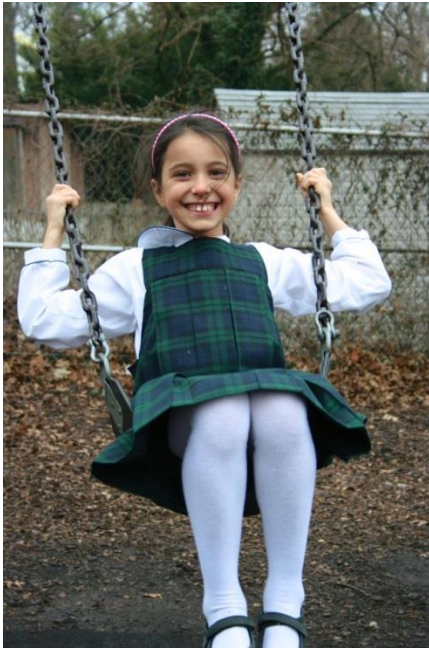
Photo 10 Plaid jumper & blouse FALL/SPRING/WINTER (shown with tights)