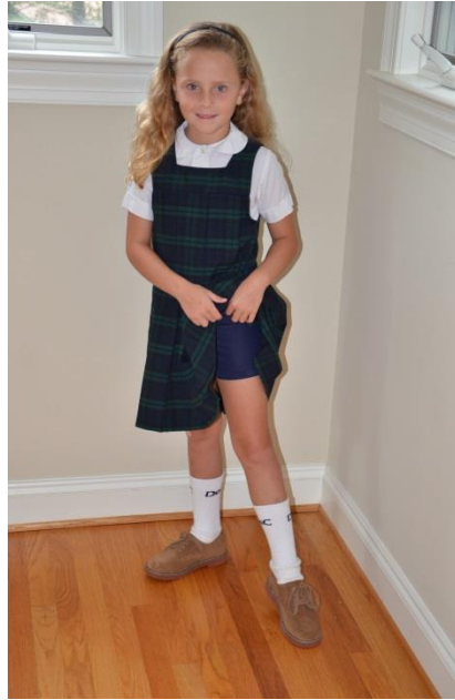
Photo 10 Plaid jumper & blouse FALL/SPRING/WINTER (shown with "monkey" shorts)