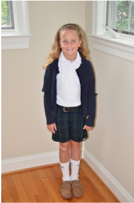
Photo 8 White polo & plaid shorts FALL/SPRING (shown with optional buttoned down sweater)