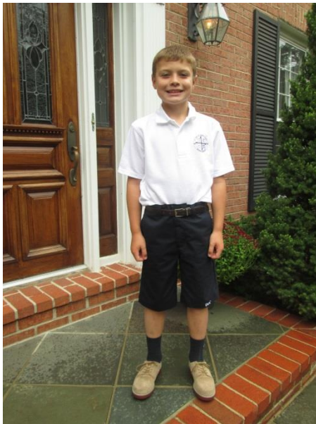
Photo 1 White polo & blue shorts FALL/SPRING