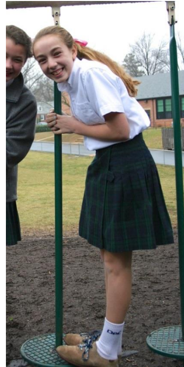
Photo 12 White oxford & plaid skirt WINTER